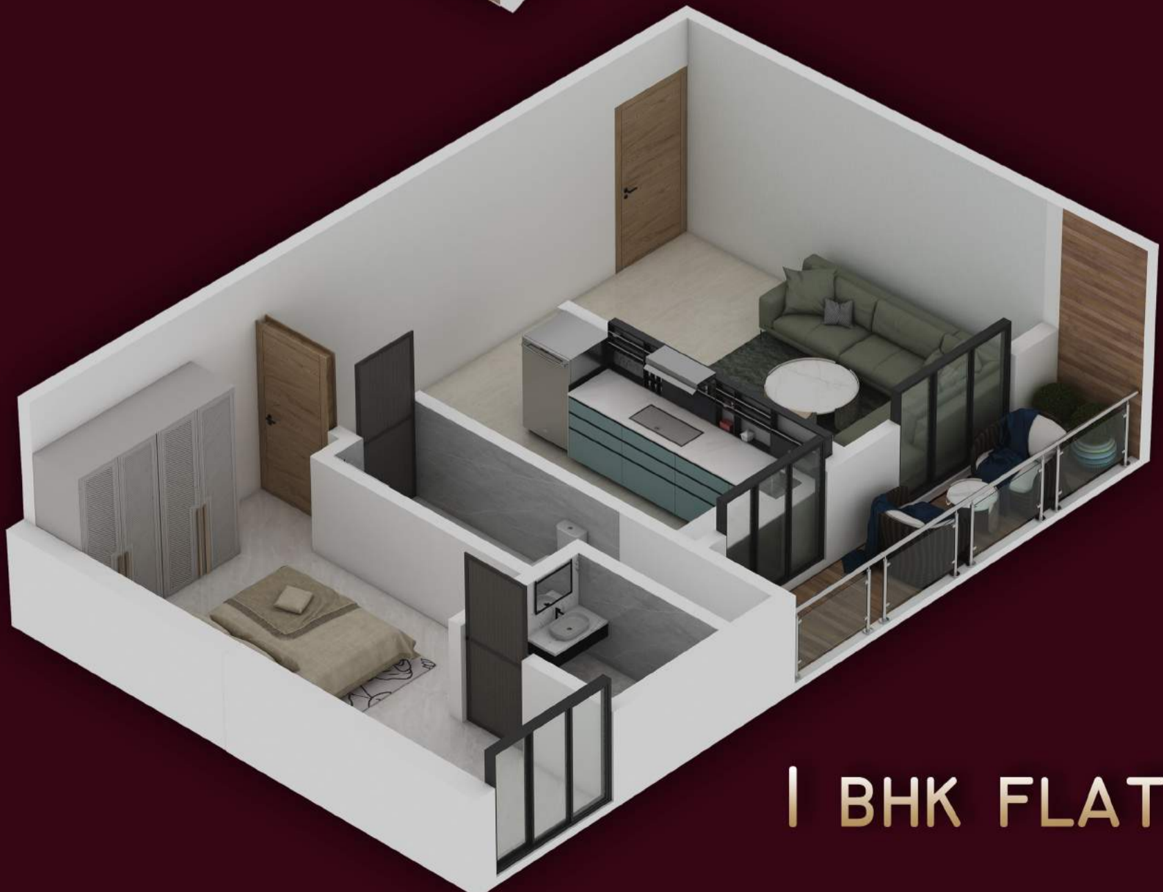
1 BHK FLAT