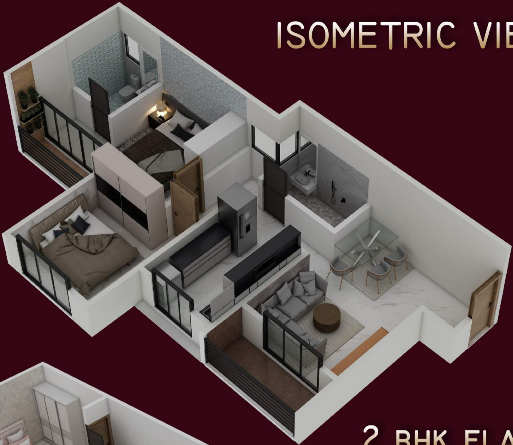
2 BHK FLAT