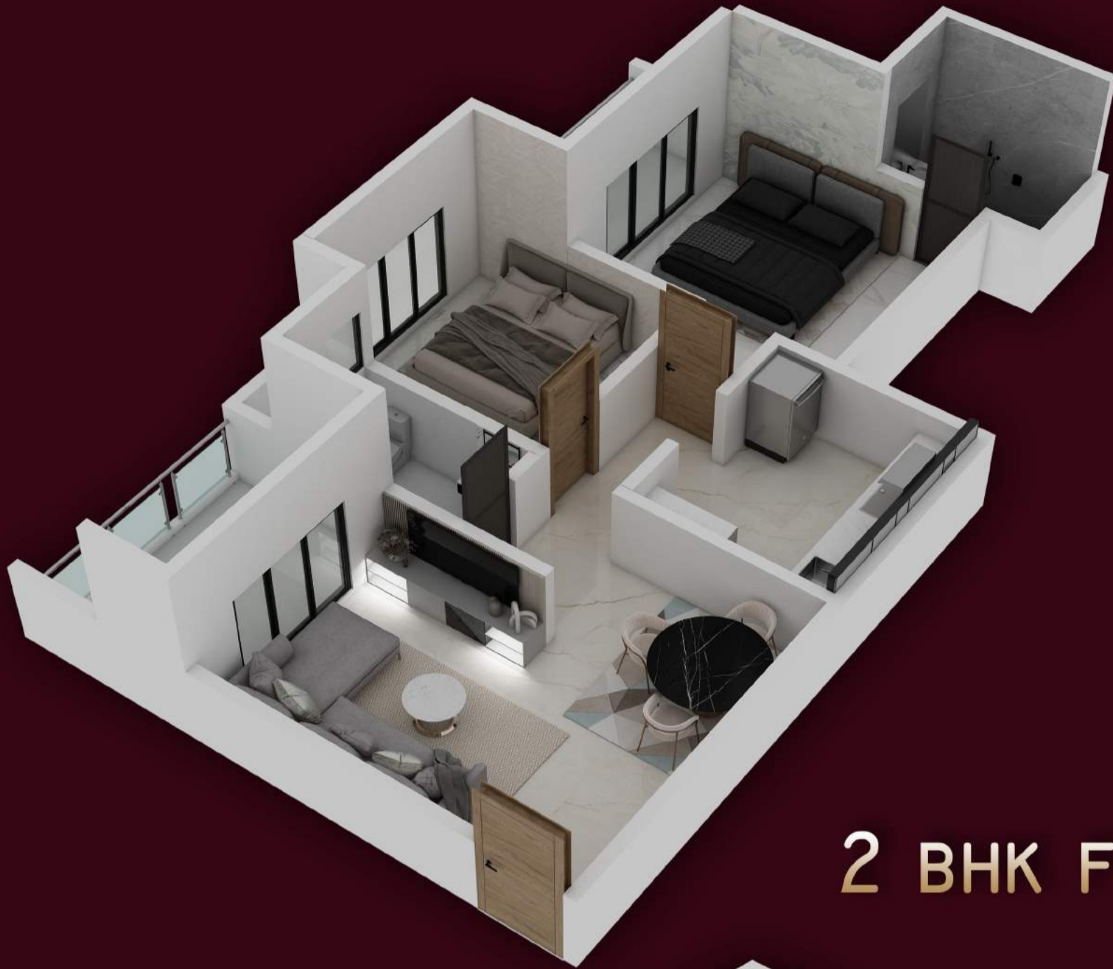
2 BHK FLAT