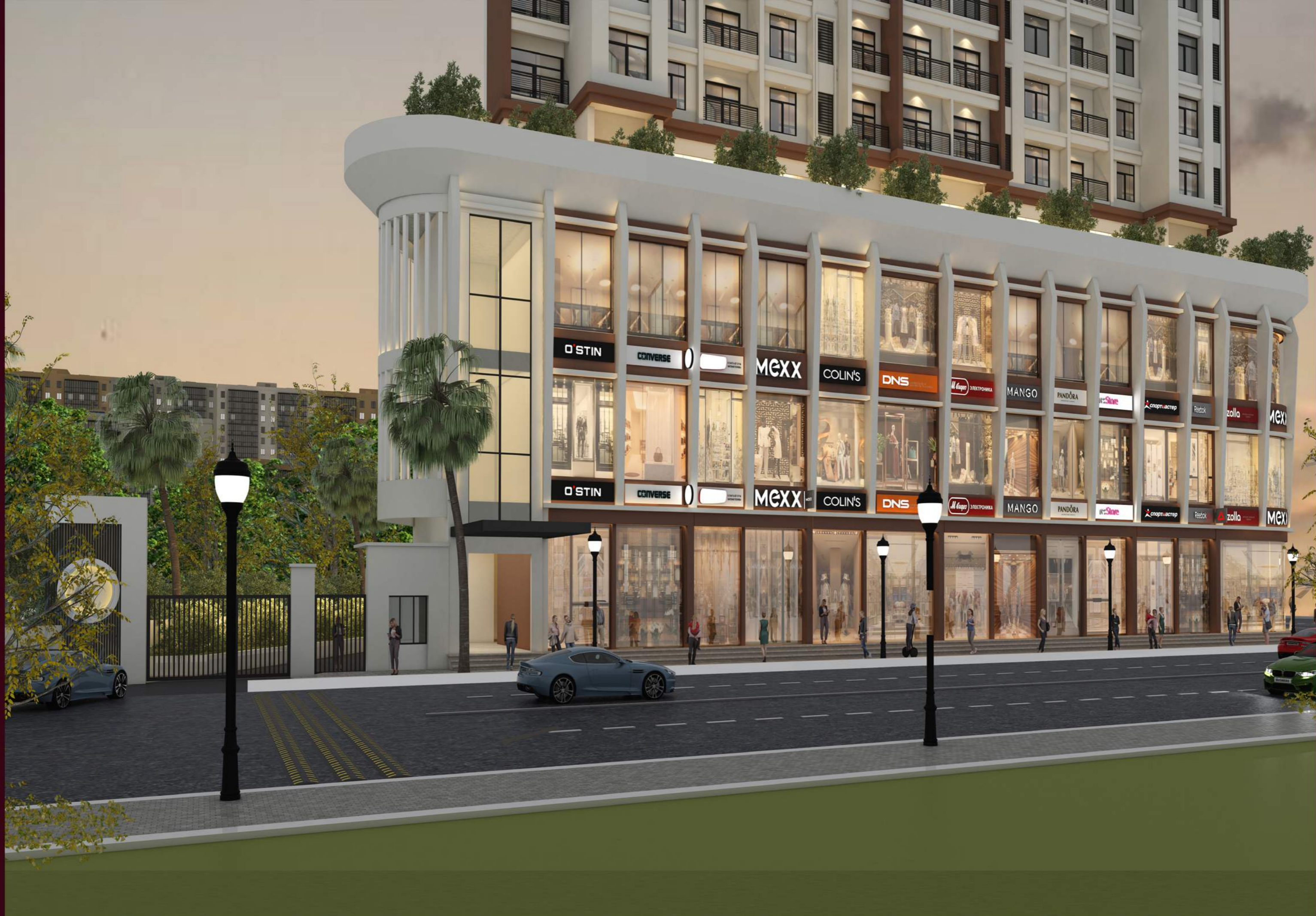
“The Ideal Place Where Your Business Should Be Seen.”