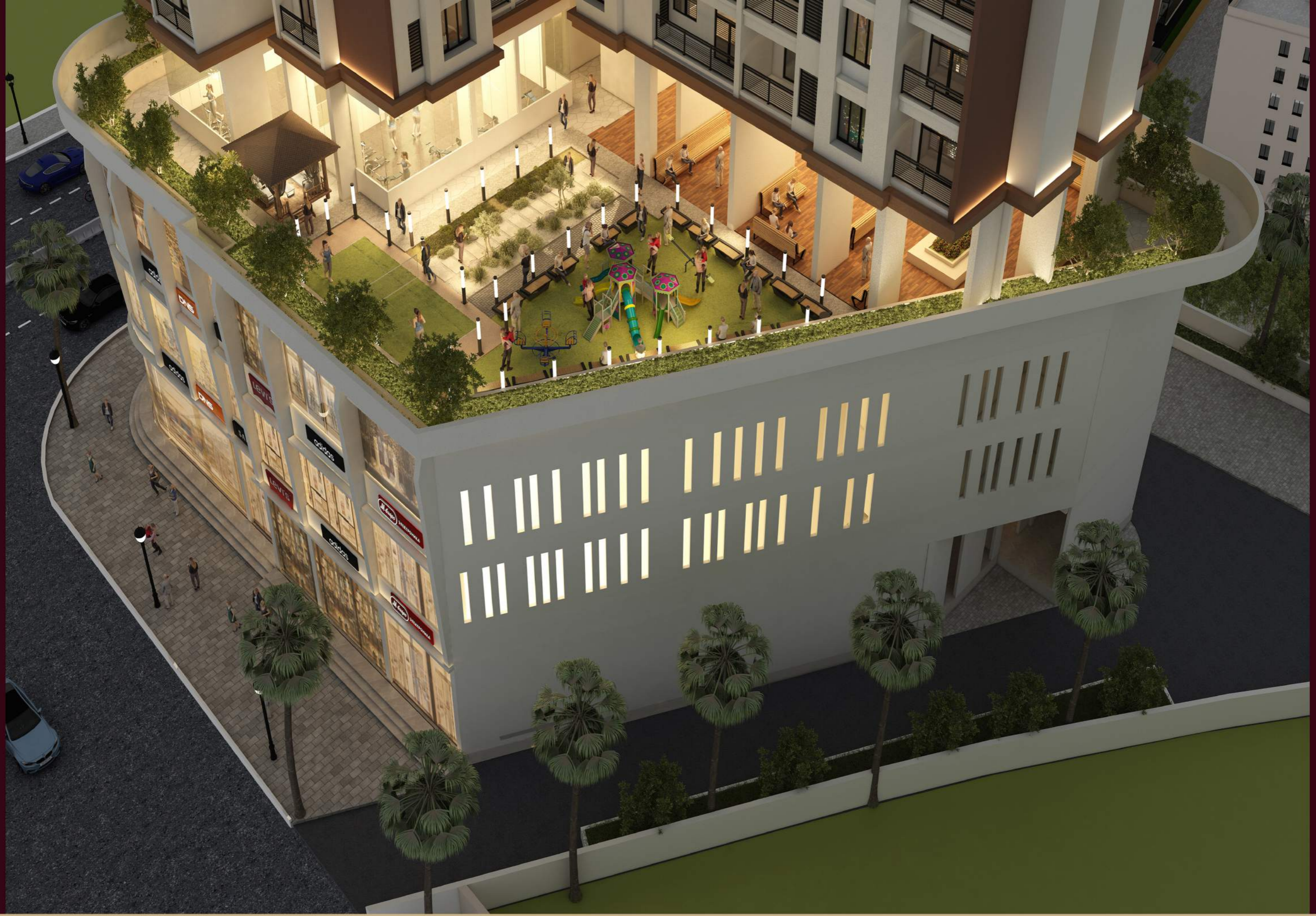
"Where Fun Meets Learning: Play, Perform, and Grow!!"